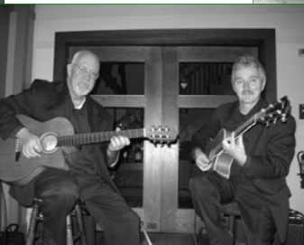
The jazz combo Natural Elements performed during dinner.

Food and beverages from a number of local restaurants and wineries were a feature of the evening.